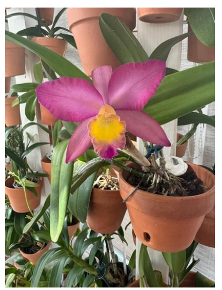
LC Secret Love