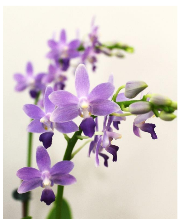
Phalaenopsis Summer Rose "Blue Star"