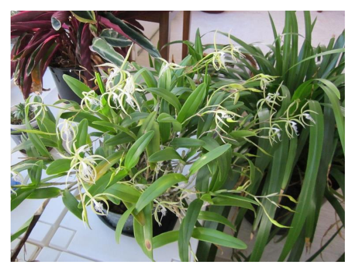
Epi (Coilostylis) cilare