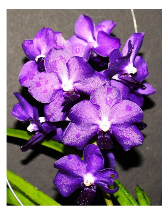
Vandachostylis Ploenpit Blue