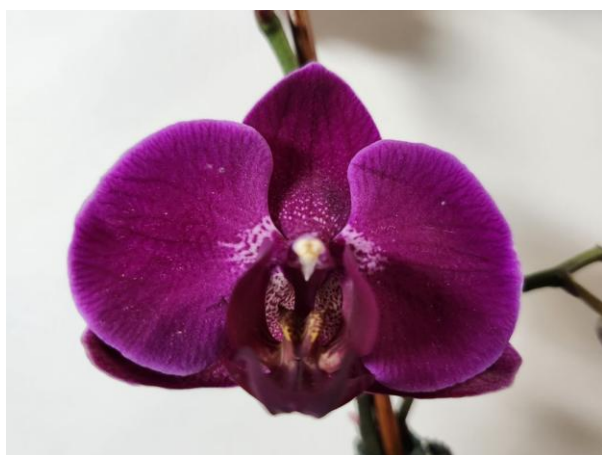
Phal No ID