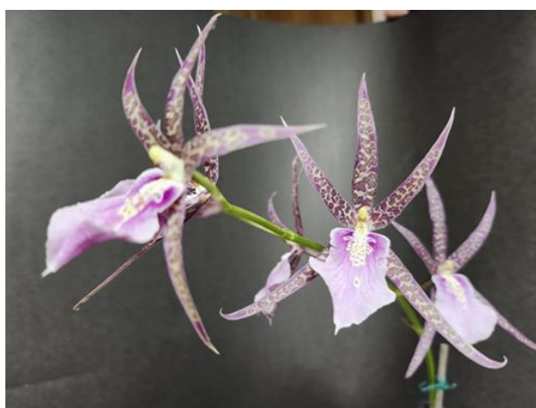
Miltasia aka Bratonia Fitch