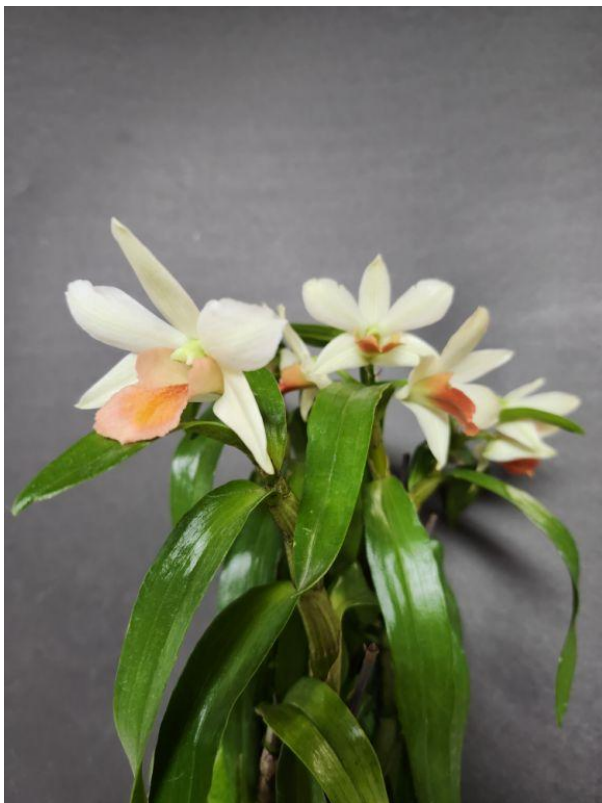
Den Thai Jasmine