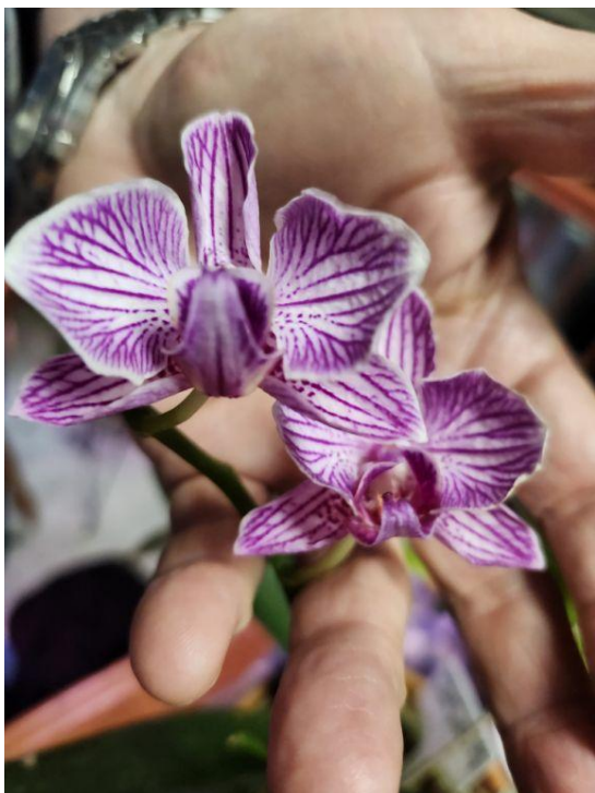
Phal No ID