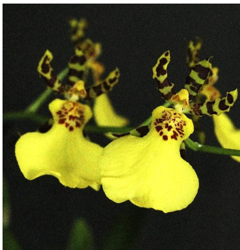
Gomenkoa Honey Bee