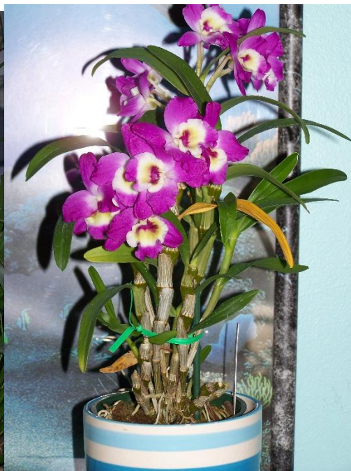
Den "Country Girl"