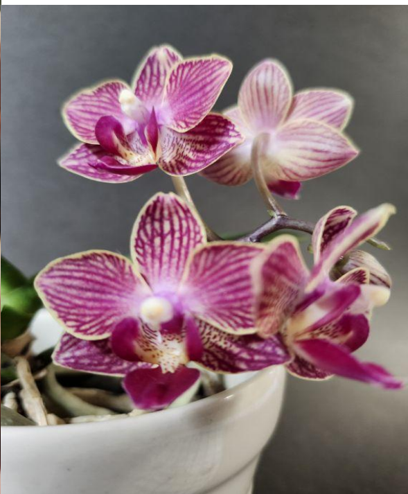
Phal No ID