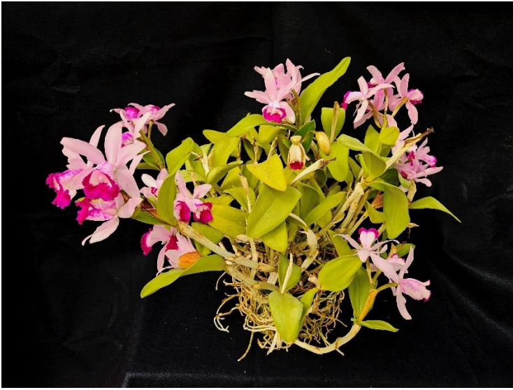
C. intermedia v orlata "Crownfox"