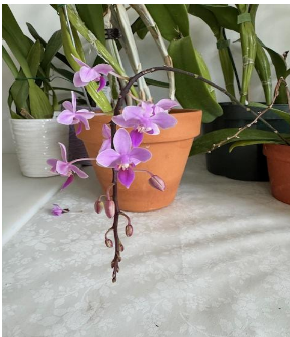
Phal equestris x self