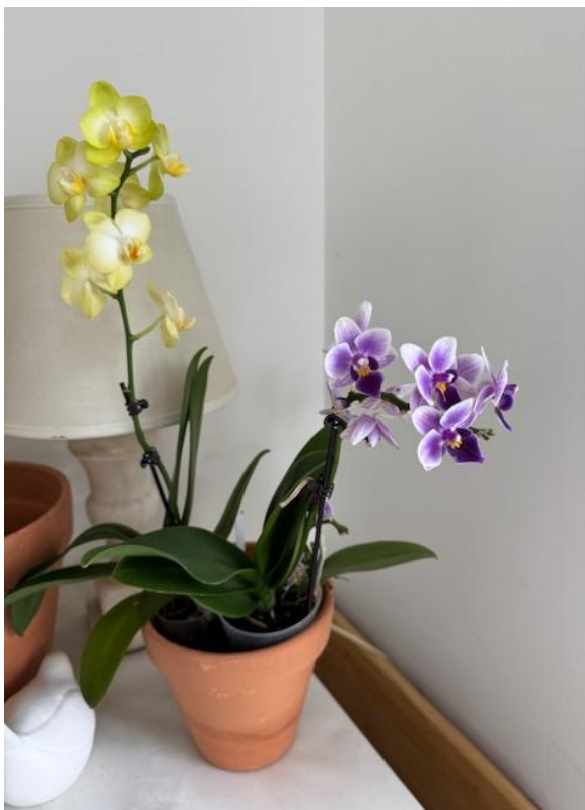
2 No ID Phals