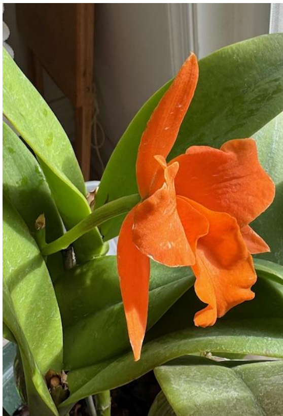
BLC Fuch's Orange Nugget