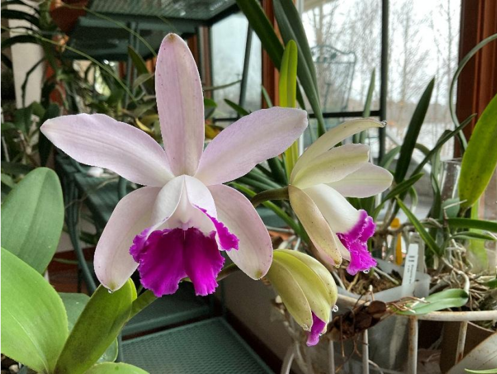
C. intermedia v orlata "Crownfox"